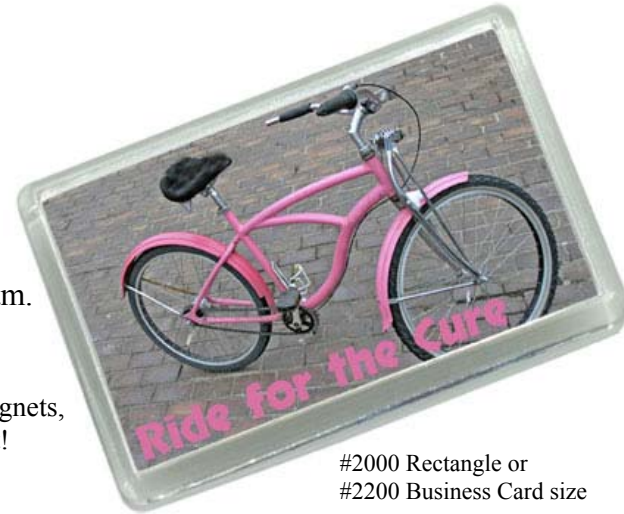
#2000 Rectangle or #2200 Business Card size

Selling Points: Durable crystal clear acrylic magnet. Everyone loves magnets, especially when it looks like a clear photo frame. It's a super strong magnet! This acrylic magnet will ensure your message is displayed beautifully and crystal clear. Light weight for mailing.