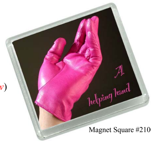
Magnet Square #2100

Additional Information: This qualifies for our Non Profit Program. NQP plus 5% back to Charity)